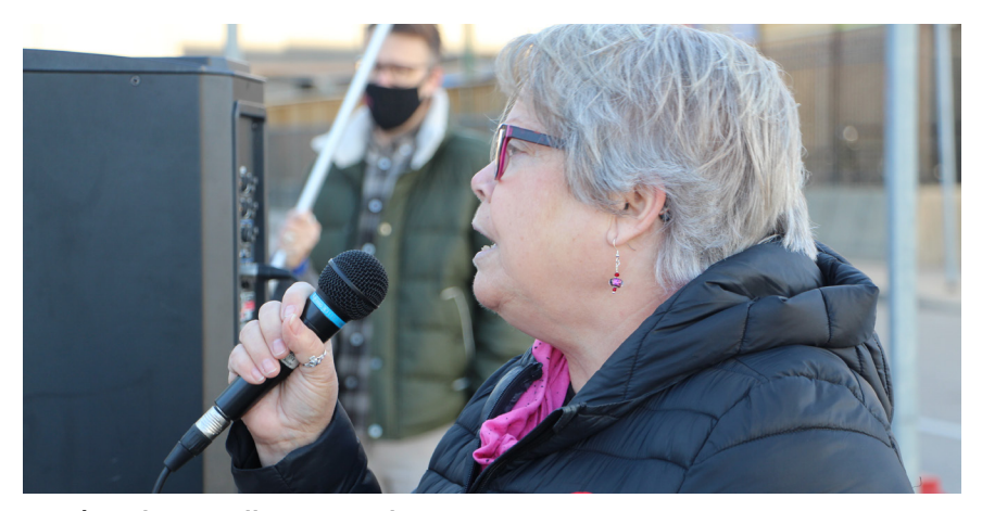
P8 | Labour rallies at Sask. Party convention