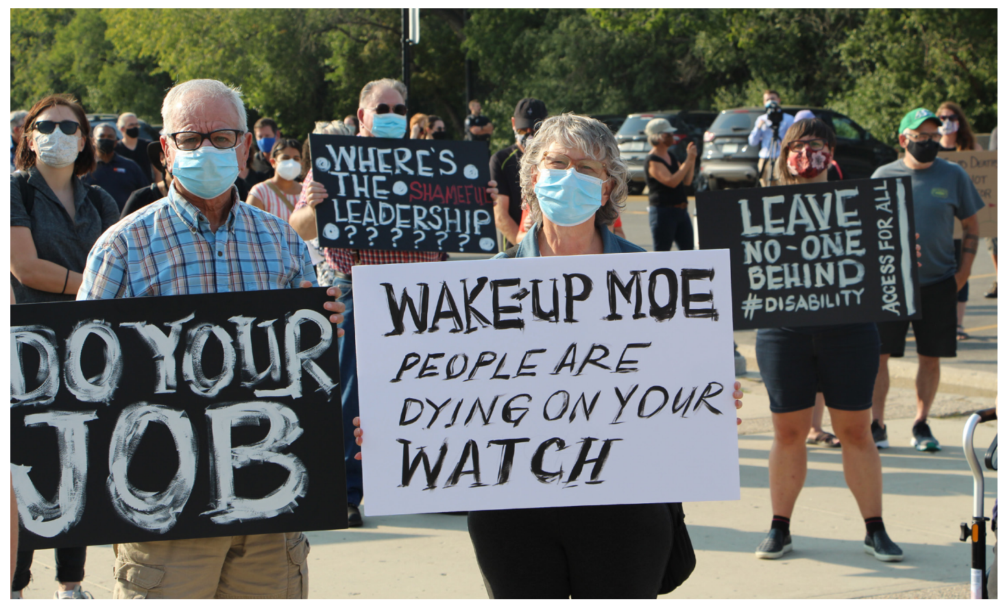
Workers and activists gather at the Legislature to demand action on the COVID-19 pandemic fourth wave in September.