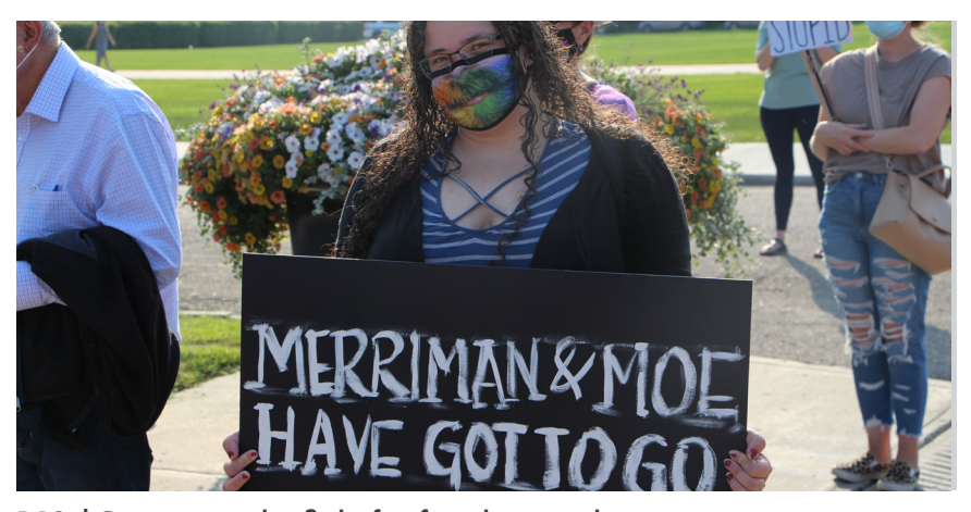
P13 | Continuing the fight for frontline workers